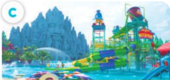
Suoi Tien Theme Park / no