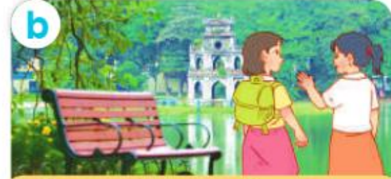
Hoan Kiem Lake / yes