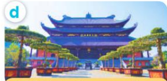
Bai Dinh Pagoda / no