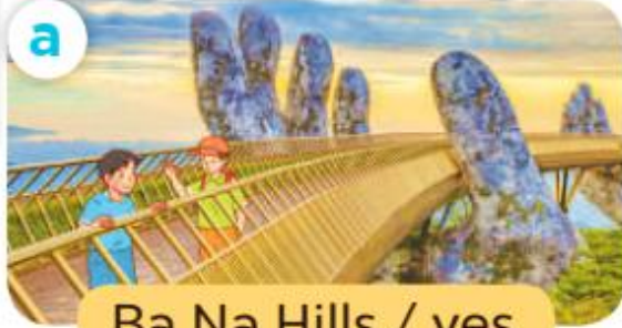
Ba Na Hills / yes